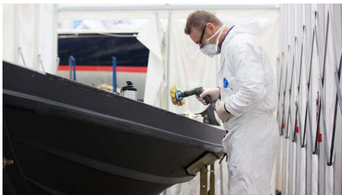
Maintenance being carried out on Pacific 24 RIB

Berthon also has a long history of boatbuilding and vessel construction in the commercial sector, building over 35 lifeboats for the RNLI. We've built numerous pilot, patrol, survey and multi-role vessels, all of which meet the high demands placed on them in the commercial working environment.