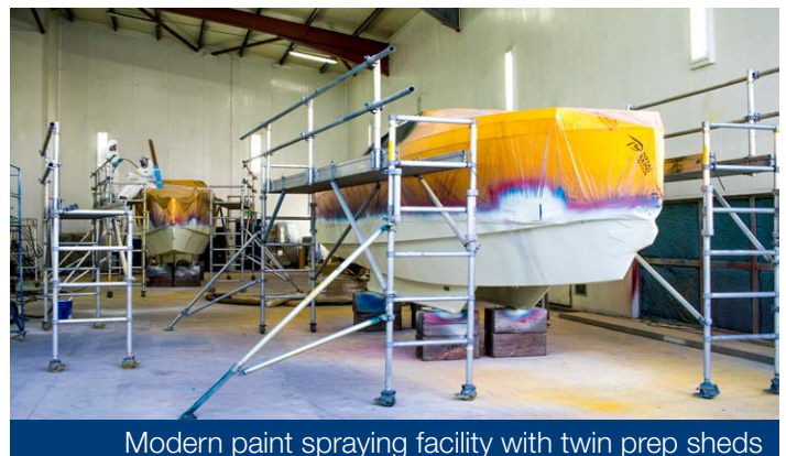
Modern paint spraying facility with twin prep sheds

The Shipyards, Lymington, Hampshire, SO41 3YL, England T: +44 (0)1590 673 312 F: +44 (0)1590 647 446 E: projects@berthon.co.uk