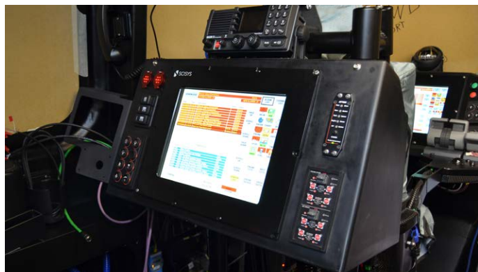
Installing the latest technology in navigation & comms