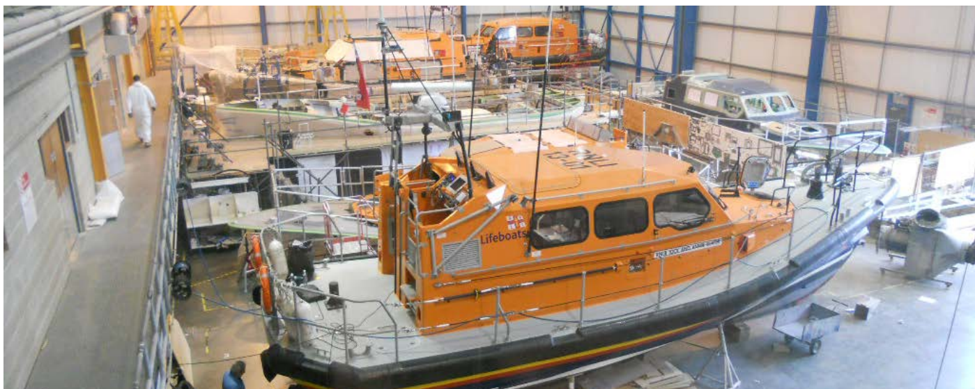
Production line of RNLI Shannon Lifeboats in one of our work sheds