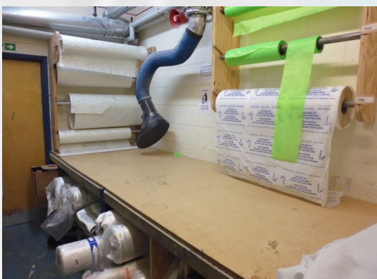
COMPOSITE & GLASS CUTTING

"It is the personal touches that make the difference and Berthon provide those with abundance. I would not hesitate to recommend them as the premier shipyard in the UK."