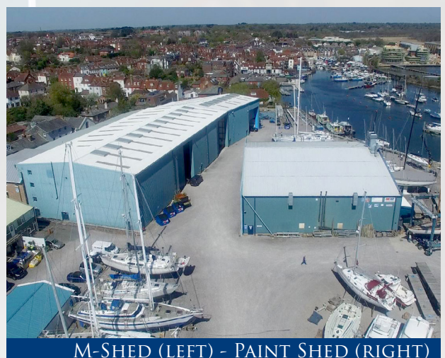
M-SHED (LEFT) - PAINT SHED (RIGHT)