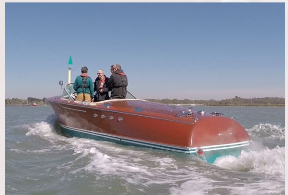
RIVA TRITONE UNDERGOING A SEA TRIAL

Berthon's in-house skippers and crew are qualified to carry out sea trials of the tenders we've worked on. It's an integral part of the superyacht service. During sea trials, craft are fine-tuned by our marine engineers; they are then cleaned, polished and prepared for transportation. Project managers are available to clients after the return of tenders to discuss ongoing service requirements, maintenance and use of any new equipment installed.