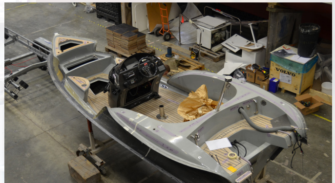
PASCOE TENDER REFIT FOR M/Y RAHAL