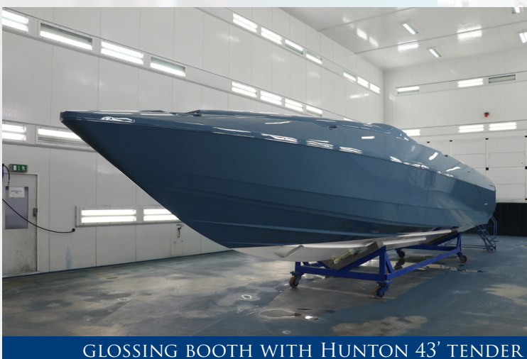
GLOSSING BOOTH WITH HUNTON 43' TENDER