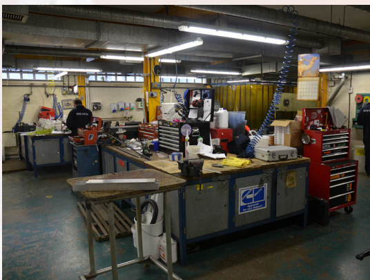
MARINE ENGINEERING WORKSHOP

Berthon employs marine engineers carrying out mechanical fit outs, pipe fitting and plumbing, engine servicing and repairs and fabrication and welding on boats in build or in refit or repair.