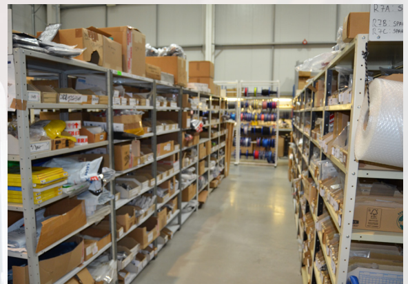
BERTHON'S EXTENSIVE STORES

Berthon provides vital in-service maintenance support and refit services to private and business clients. This involves everything from sourcing parts, design consultancy, planned maintenance, routine servicing and repairs, to major life extension programmes where minimising downtime is a priority. Berthon have good relationships with superyacht refit shipyards enabling the latter to rely upon our superyacht tender services.