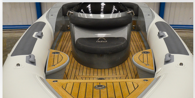
DECK AND CONSOLE WORK