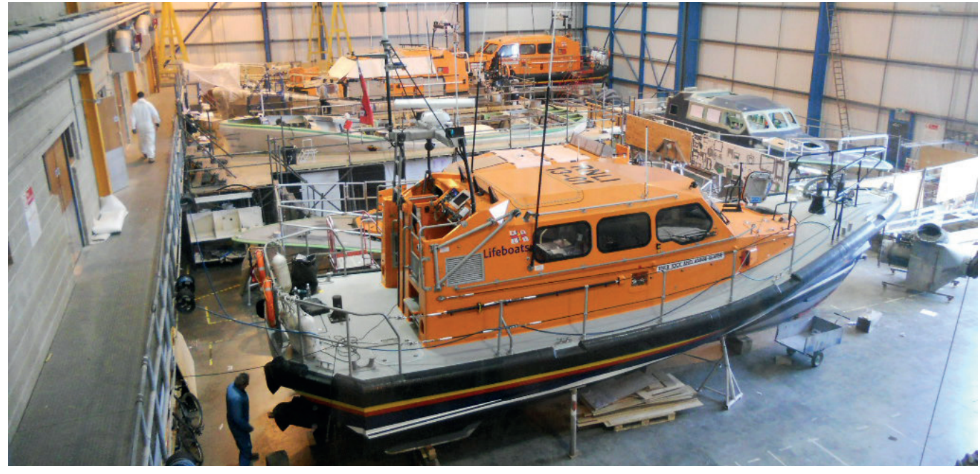
Production line of RNLI Shannon Lifeboats in one of our work sheds