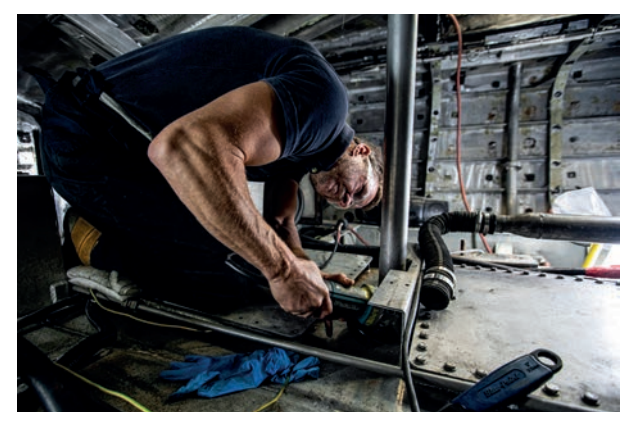
Refit on-board Fishing Support Vessel, NORMAN LE BROCQ

Berthon also has a long history of boatbuilding and vessel construction in the commercial sector, building over 35 lifeboats for the RNLI. We've built numerous pilot, patrol, survey and multi-role vessels, all of which meet the high demands placed on them in the commercial working environment.