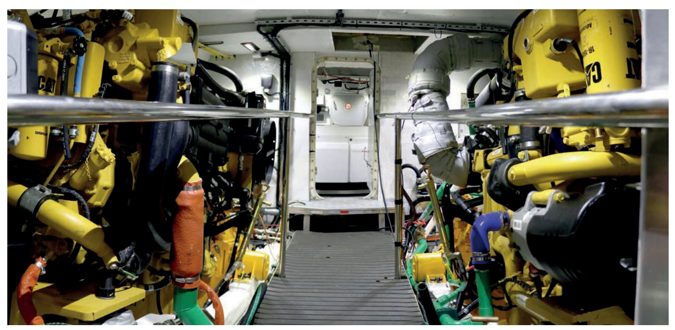
Installation of twin Caterpillar C18 810HP engines to a 60' stretched Arun MOD Police patrol boat