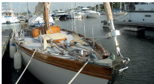
Electric windlass system