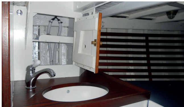
New hot and cold water system

enhancer and even a Fusion iPod marine stereo were installed to give Mitten her a new hip chick image in the world of classic cruising – as well as a solar panel! Further enhancements have included necessities such as a fridge (carefully hidden behind traditional joinery fronts), a new hot and cold water system, as well as more importantly, a new Volvo engine.