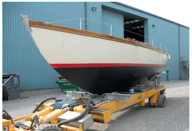
Leaving the paint shed