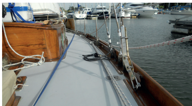
Upgraded rigging and deck gear