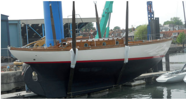
MITTEN being launched