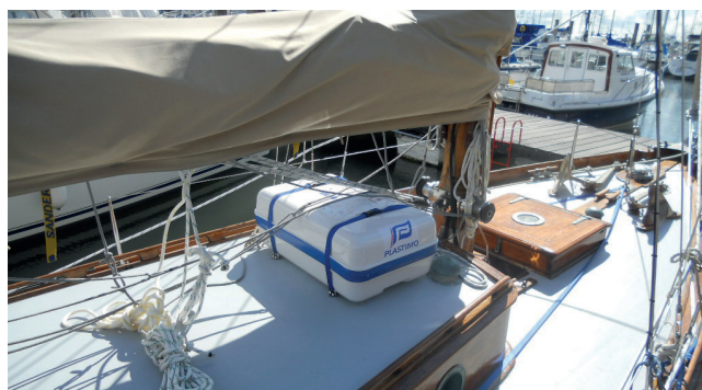
Rebuilt mainsheet system